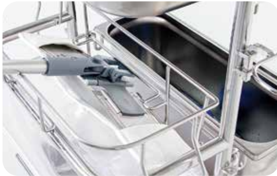
Remove with pressure—dirty mops fall into a waste bag