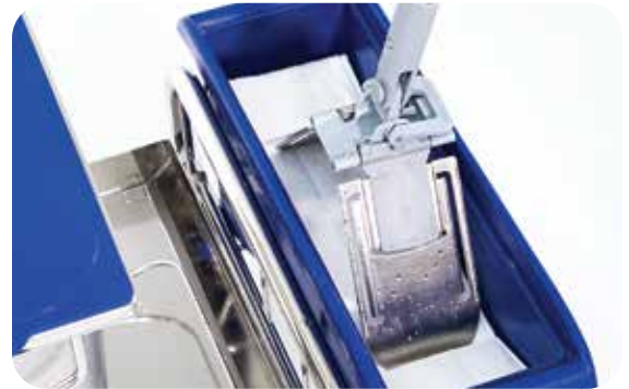
Insert a Saturix Mop Frame into a Saturix Microfiber Mop