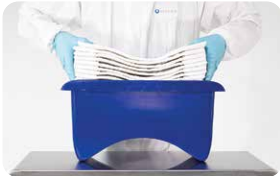
Easily impregnate up to 10 mops with cleaning solution