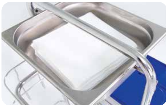
Convenient storage of easy-to-access wipes